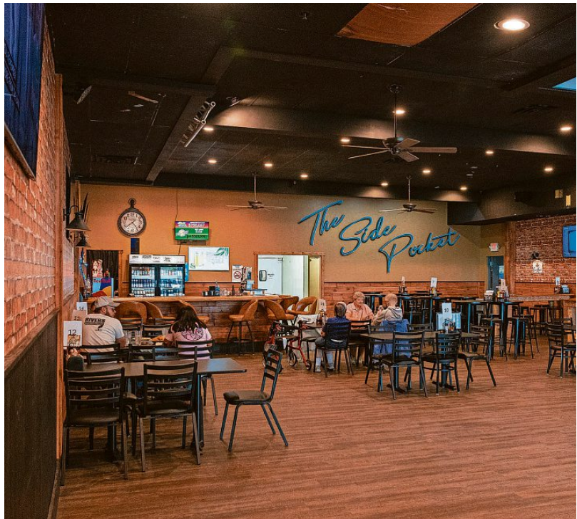
The Side Pocket at Black River Billiards serves fresh, homemade food at 91 Douglas Ave.

The Side Pocket, a new restaurant located in the business’ former storage space, is a bit of a hidden gem.